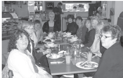
Christchurch occupational therapists – get the week off to a tasty start OTs breakfast

presentations, awards, an equipment amnesty, TV interviews, banners, balloons and flags.